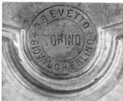
Trademark on case of Sector clock.