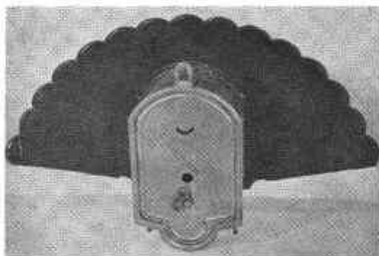
Rear view of Italian Sector clock.

The colorful painted scene on the dial is of a boy and girl on a balcony